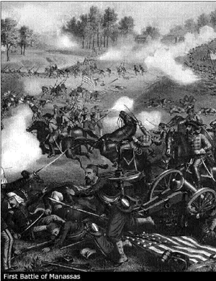
First Battle of Manassas

30 Confederate cavalry burn Chambersburg (PA)