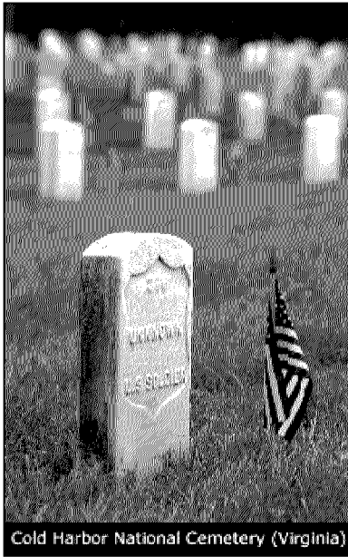
Cold Harbor National Cemetery (Virginia)