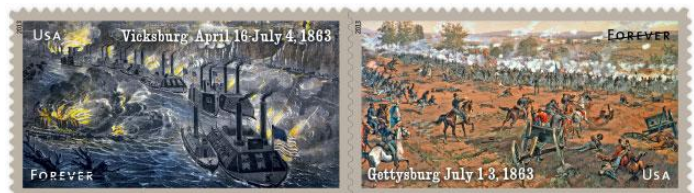
Civil War Timeline for April

Respectfully submitted, Pat Munson-Siter