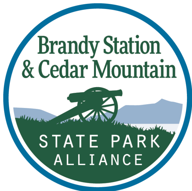
Civil War Related Events

Most of these are from the Civil War Traveler website. Unfortunately the state of New Jersey still does not participate in this program, so you won't find any New Jersey events listed here. Those we know about will be listed in the "local events" section on page one.