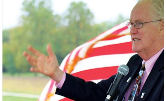
Jim Lighthizer speaking at press event at Antietam in 2015.

groups across the country, the Trust protected nearly 1,700 acres of land in 13 states during 2015. In addition, the conclusion of the Trust's four-year capital campaign raised an unprecedented $52.5 million — more than 30 percent above the original goal — resulting in more than 10,000 acres of preserved hallowed ground.