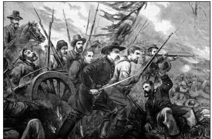
Union forces on the offensive in 1864.